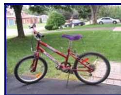
Girls bike age 7-9

To receive your bike call the office and talk to Sharon at 526 5051 .